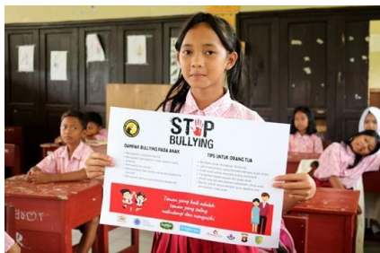
More than just football - the children learn teamwork and respectful cooperation

The academy started in 2015 with just 14 children. Word quickly spread that it was fun to take part, and today the academy already has 465 football players in five training centres. There are four all-girls teams.