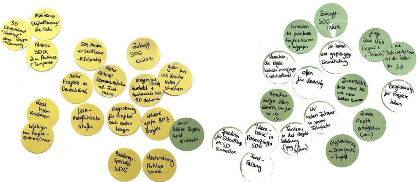
What do we want for and from SD? Suggestions from our members at the 2023 AGM

I particularly liked the fact that we asked ourselves the same questions at the Board meeting in March 2023 and came up with very similar answers. Read for yourself: