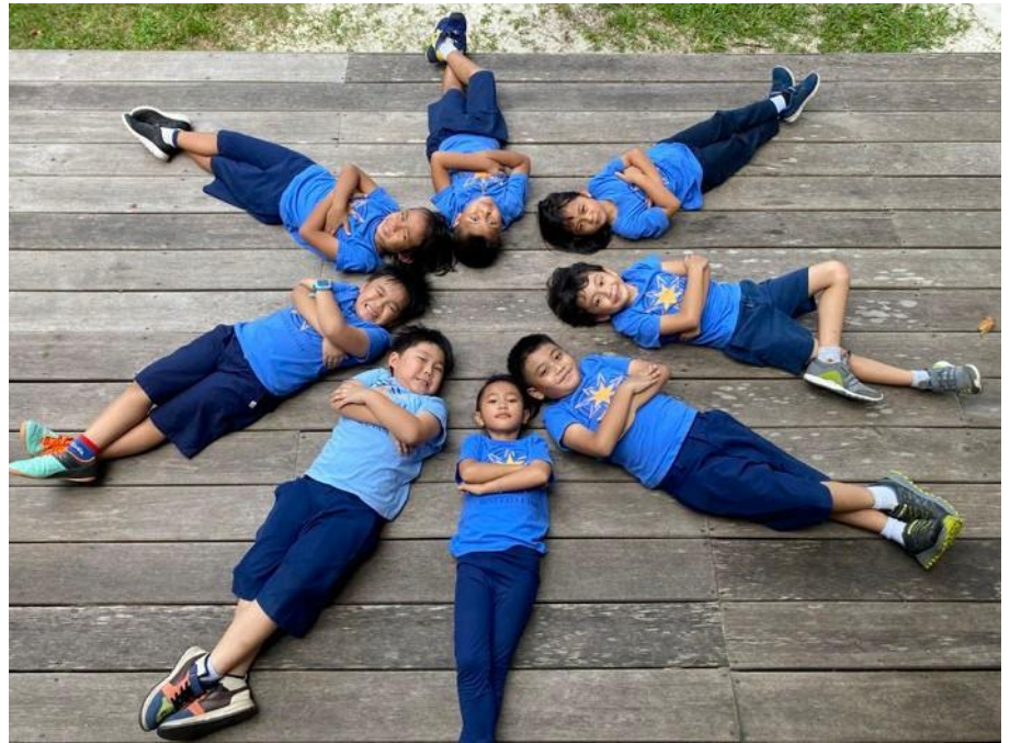
At the BCU school, SD particularly supports the scholarship programme for students from low-income families

SD was successful in obtaining funding for the Kitchen Garden Project from the Schöck Family Foundation for the 2023/24 and 2024/25 school years. The Schöck Family Foundation is providing 12,300 euros for each school year, which, together with international donations, will fund the project over the next two school years. We need 3,000 euros per year to cover our own contribution to this project.