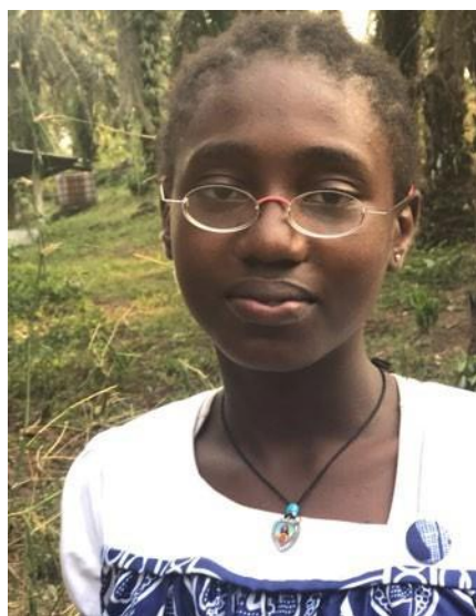
More than 350 people have already received a pair of OneDollarGlasses

Gic Sagric, together with the Cameroonian organisation Vopaca, also enabled more than 800 people to receive eye examinations from a qualified team on three campaign days in Douala in 2023. More than 350 people received spectacles. SD received the spectacle frames and lenses for this project at a cheap price from the association EinDollarBrille e.V. (GoodVision). The aim is to bring affordable and very durable spectacles to people who would not be able to afford eye examinations and visual aids under normal circumstances.