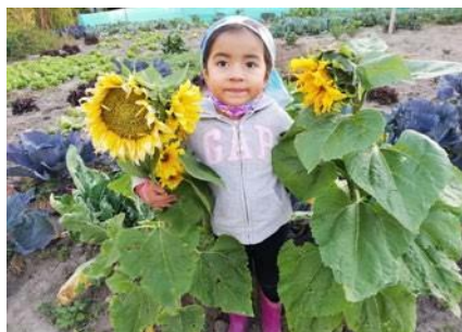
The educational centre in Otavalo is a place of learning for ALL children

Founded in 1994, the kindergarten and the resulting school "Juan Enrique Pestalozzi" are the only inclusive educational institutions in Otavalo. Their aim is to realise a sustainable form of learning and thus offer a socially equitable programme for ALL boys and girls - with or without disabilities - and their families.