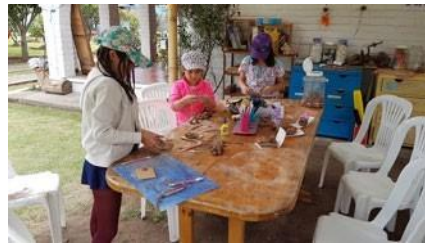
All three educational projects work with Montessori learning materials

In the Ludoteka environment, children interact freely with various didactic materials, most of which are Montessori-inspired. There are a variety of indoor and outdoor areas with a so-called prepared environment for free play: outdoor, gardening, crafts, carpentry, experiments, cooking, music, table games and puzzles, role play (dressing, shop, doll's house), among others.