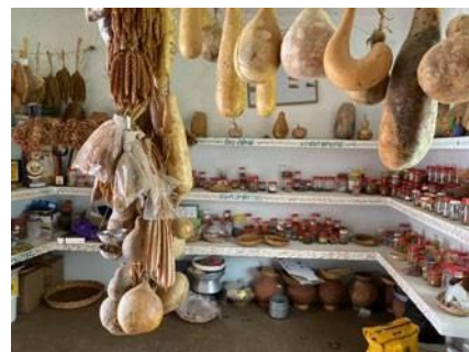
Seed bank of the Anisha Rural Centre

In addition, it supports farmers to generate and save money and to improve soil fertility.