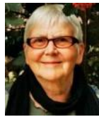
SD contact person: Waltraut Biester

An anamed medicinal plant seminar in Douala is being planned for 2024, for which funding is still outstanding – we look forward to your support.