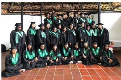
Final photo for the presentation of the 2021 certificates with robe and hat