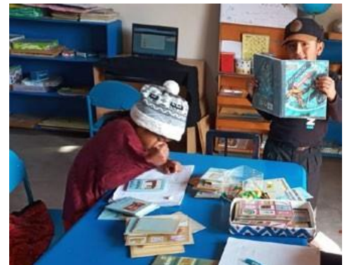
Teaching materials in particular are always needed

The Yachay Kawsay Foundation is a non-governmental, non-profit organisation that offers a non-directive, non-school-based self-learning programme. It is taught and learnt in Kichwa and English. Yachay Kawsay is a community of the Kichwa-Saraguro people in the south of Ecuador in the province of Loja. The foundation was established in 2019 to fulfil the goal of the member families to create and live a regenerative community based on Andean principles and values.