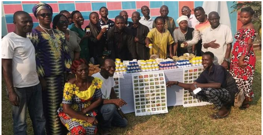
Completion of the second anamed seminar in 2023 in the second MEDNAT training series