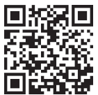
Film about the children's village "Children of Heaven" https://www.youtube.com/watch?v=pQfsMqLCho