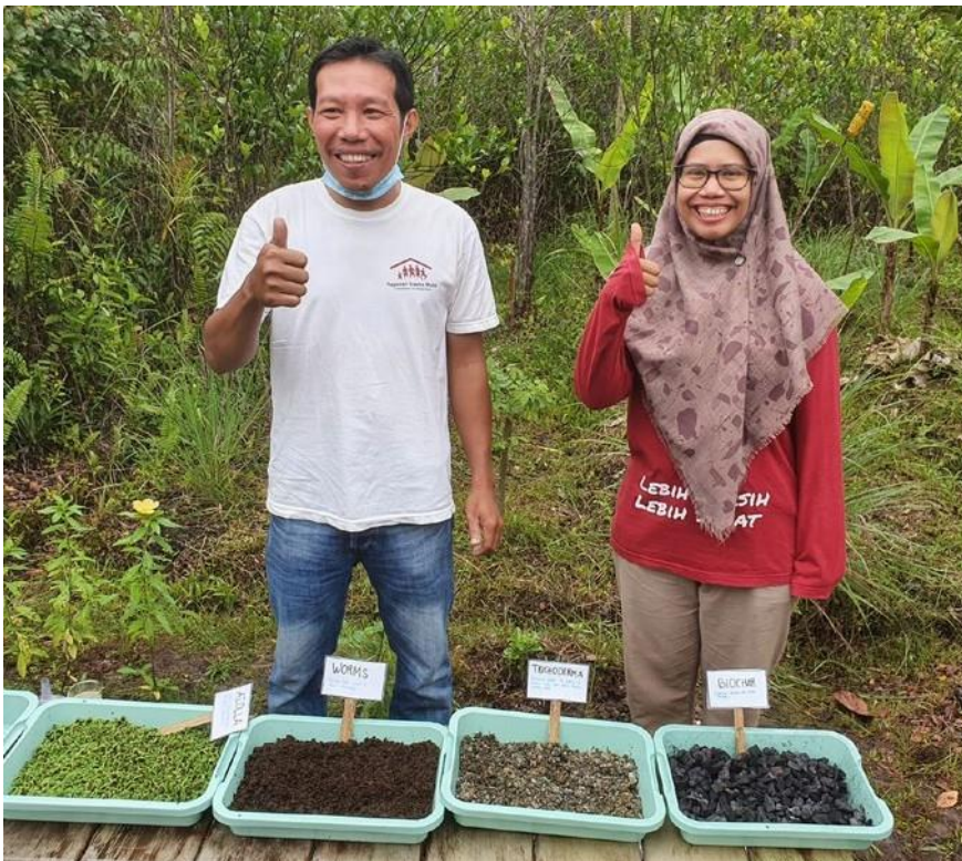
Trainers for the AgroForestry project on the YUM research site

The positive results of this work have created mutual respect, trust and a sense of reliability between the community members and the team members of the non-governmental organisation. YUM will continue to support the communities after the end of the BMZ project in order to implement and expand agroforestry methods.