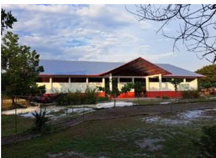
Kalimantan hall for indoor sports, culture and leisure events

But the Borneo Football International Academy offers "more than football". It also offers English lessons and IT trainings. The philosophy is that everyone can learn and benefit from each other due to their different backgrounds. In 2023, the project reached 2,460 children with educational workshops, basic English courses and school football activities. Borneo Football also supported around 320 children from local schools with jerseys, equipment and coaching assistance